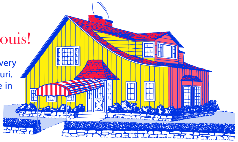
The Original-Original Pancake House,